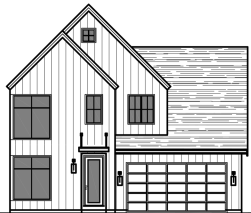
Home 6 & 8