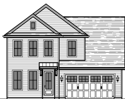
Home 4 & 7